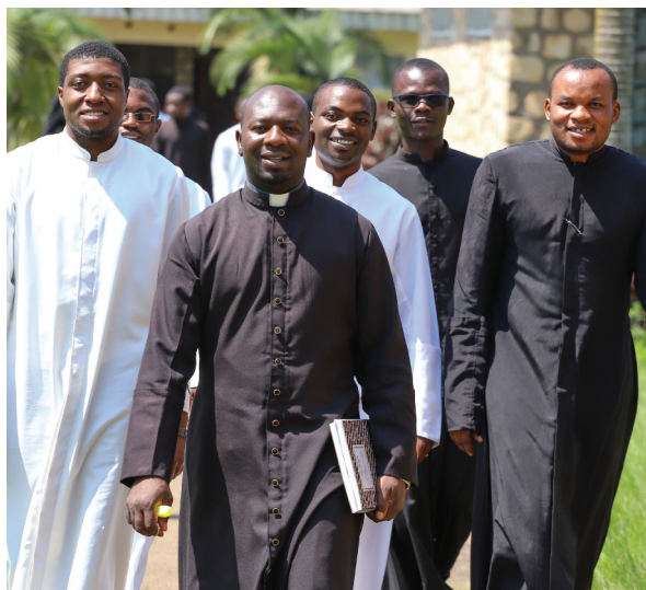
These brave young men are preparing to serve their communities

In our broken world, we need brave young men to take up the call of Christ. And by supporting them through prayers and donations, you will have a real impact on the communities they will serve.