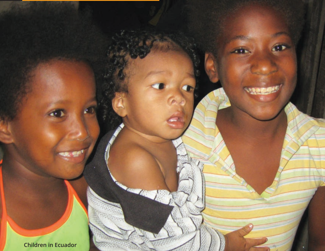
Children in Ecuador