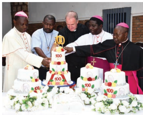
Centenary Cake: 1922-2022

We come as leaders with a fresh view, with renewed vigour and enthusiasm as