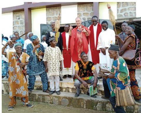
A traditional welcome

My visit to Cameroon also involved the celebration of our Mill Hill Missionaries' arrival there in 1922. The centenary was truly a success, recalling the great work begun over 100 years ago and now witnessing a vibrant Church with a very strong laity.