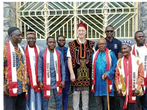
The 'Friends of Mill Hill' in Cameroon

we guide the Society over the next five years. We recognise with gratitude the unique way our Members, Associates and Students give human form to the light of the Gospel wherever they live, work and study around the world.