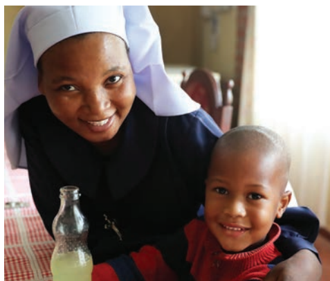
This Sister supports children at the Mua School for the Deaf, Malawi

Now, more than ever, we depend on the support and care of Catholics like you: to pass on the gift of faith to future generations.